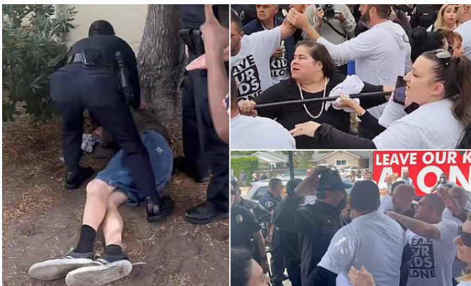
Parents clash against LGBTQ protesters outside LA elementary school