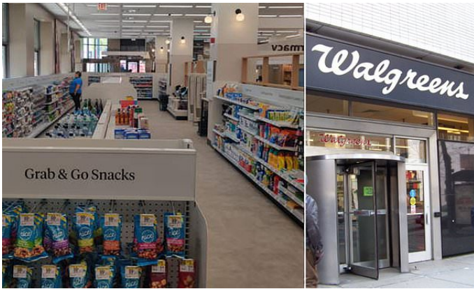
Walgreens debuts new 'anti-theft' store